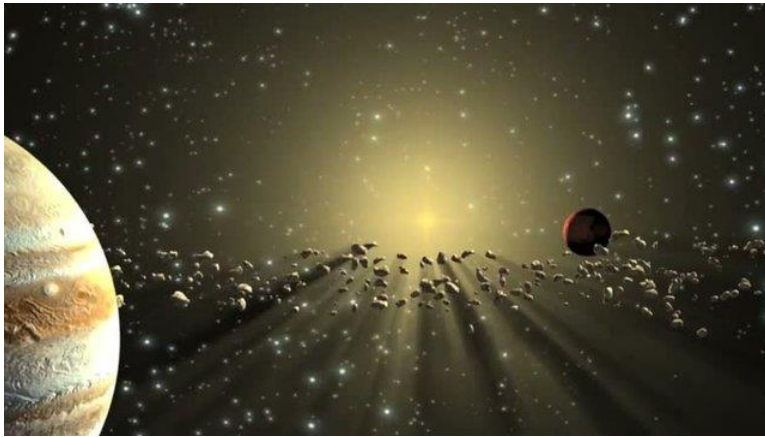
Asteroid impact would be identified as one of the “threats”.